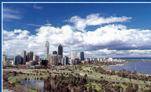
Perth, Western Australia

The University of Western Australia Perth, Western Australia 5-8 AUGUST